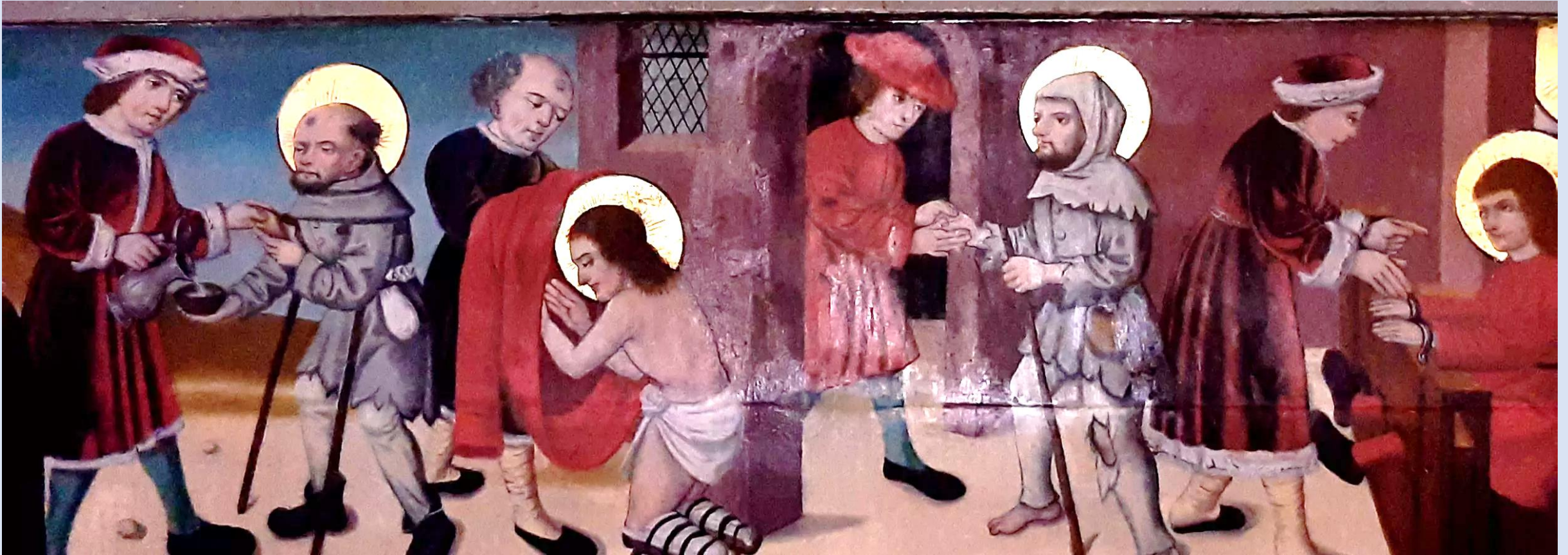
Seven Acts of Mercy, Matt. 25: 31–46